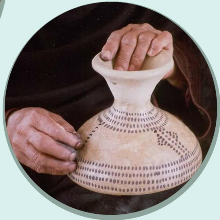
○ Needlework Pottery Carpet weaving